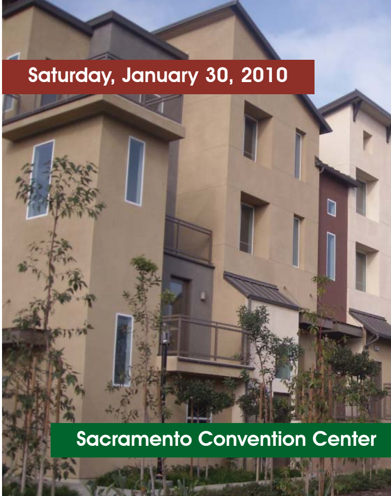
Sacramento Convention Center