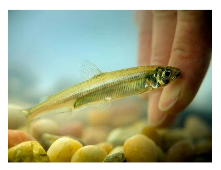
California's Delta Smelt are nearing extinction (But California water agencies don't care)