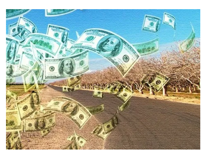
Lawsuit challenges California's approval of $16 billion to fund Delta Tunnel without CEQA review